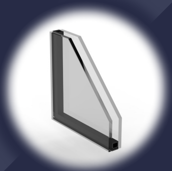
All suites can be double glazed